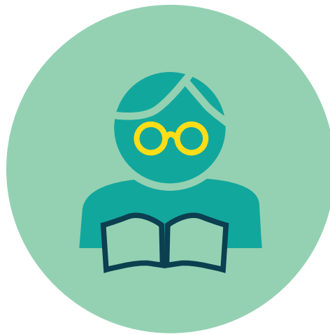
Friendly and helpful librarians