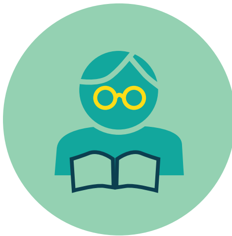
Friendly and helpful librarians