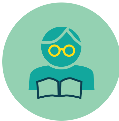
Friendly and helpful librarians